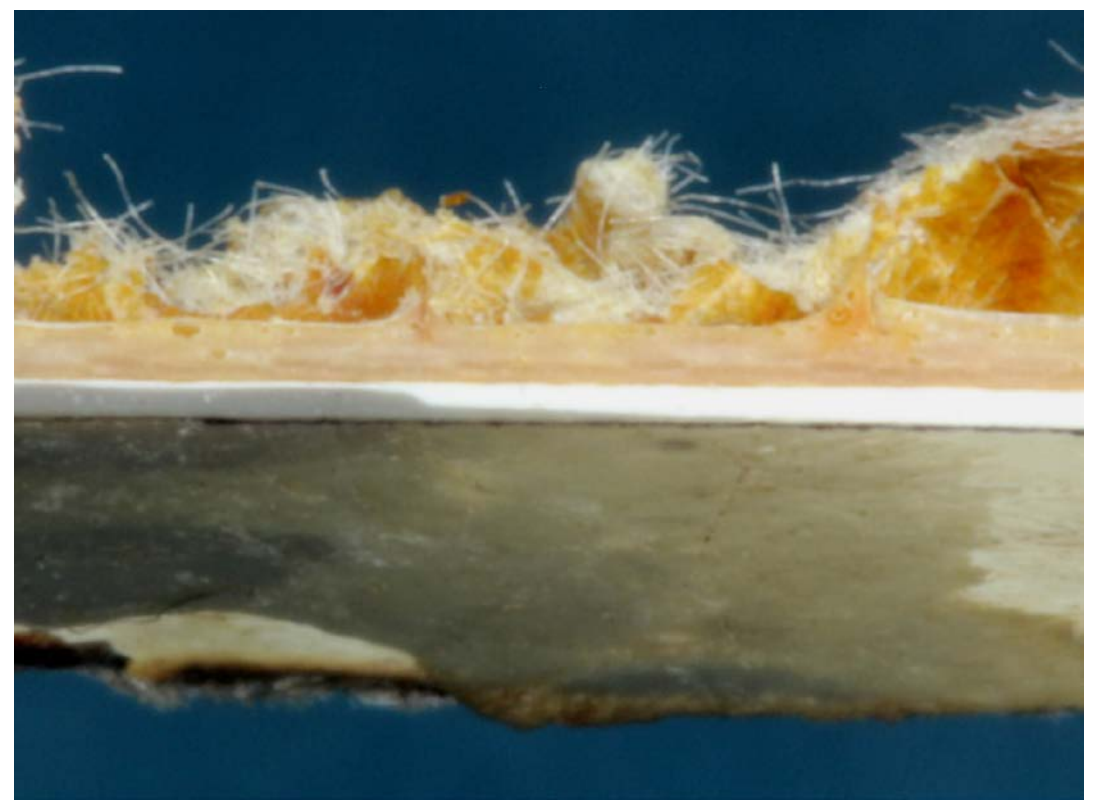
Figure 5: Cross-section through composite skin, showing surface colouration through thickness.