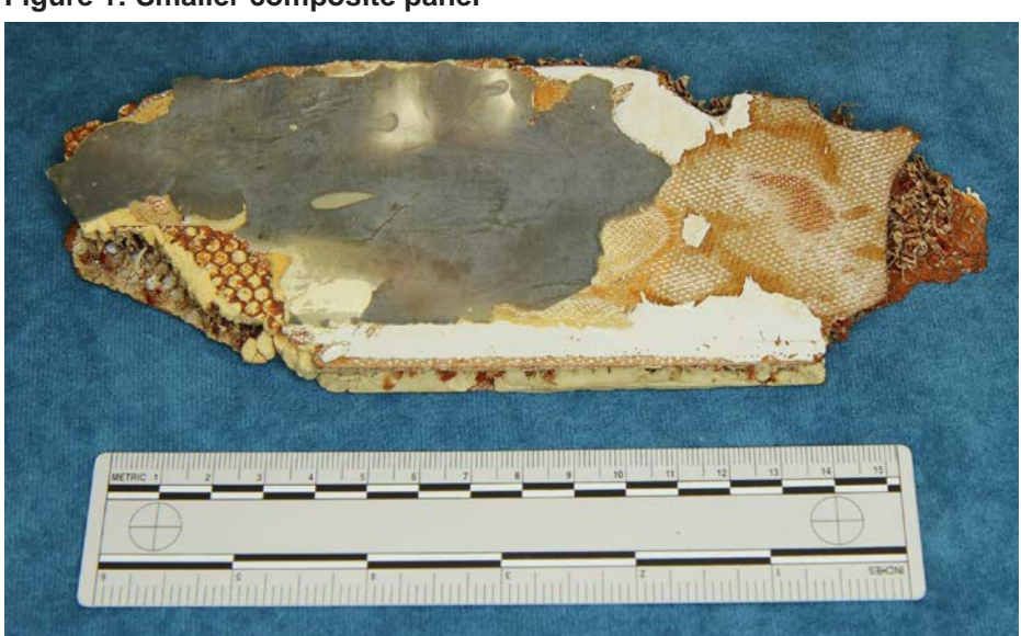
Figure 1: Smaller composite panel

Despite no evidence of overall gross heat damage, two small (<10mm) marks on one side of the larger item and one on the reverse side were identified as damage resulting from localised heating (Figures 2 and 3). A burnt odour emanating from the large item was isolated to these discrete areas. The origin and age of these marks was not apparent. However, it was considered that burning odours would generally dissipate after an extended period of environmental exposure, including salt water immersion, as expected for items originating from 9M-MRO.